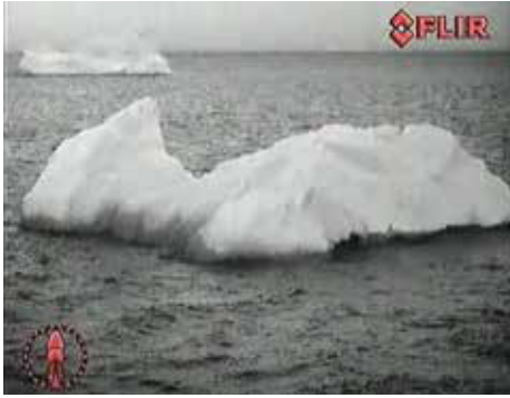
Ice is clearly visible on a thermal image. A thermal image can help the captain to navigate safely in arctic waters.

are even harder to detect by radar. This is particularly true in heavy sea conditions where the radar returns from ice floes may be lost in the so-called 'sea clutter', which means that the waves show up on the radar image, making it difficult to distinguish between ice and the waves.