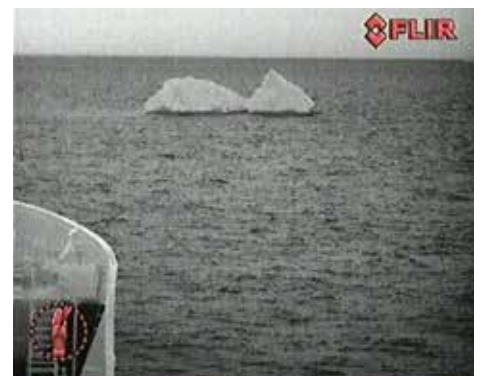
The FLIR M-625XP thermal imaging camera detects ice in total darkness, in practically all weather conditions.

Ice is not always easy to detect in arctic waters. Also not by radar. Smaller pieces