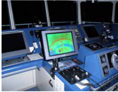
The thermal images from the FLIR M-625XP are displayed on a screen integrated on the bridge.

Prime Ltd., a FLIR distribution partner that operates within the Greek territory, supplied TMS Tankers with two FLIR M-625XP thermal imaging cameras.